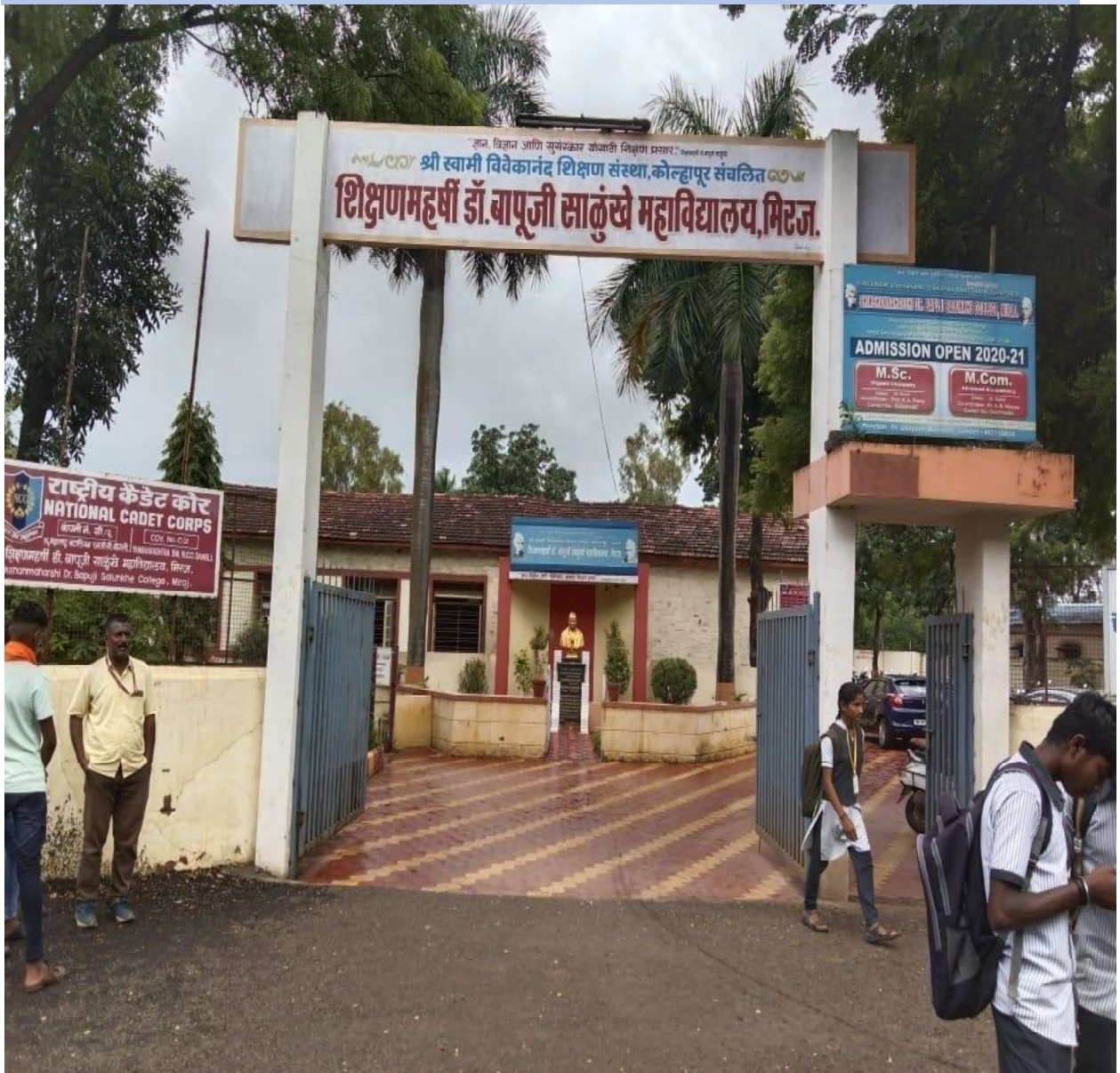
Shikshanmaharshi Dr. Bapuji Salunkhe College, Miraj.\